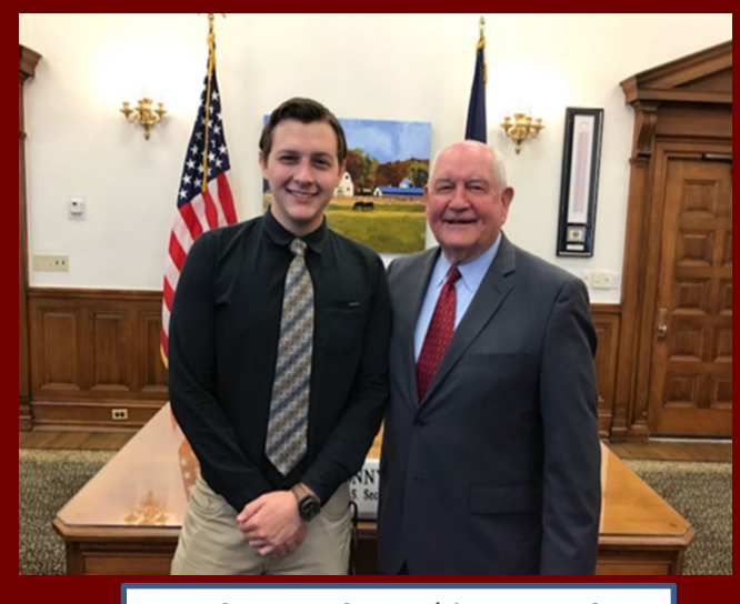
USDA-AMS, Washington, DC