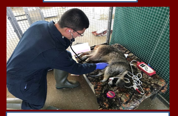
USDA-APHIS-Wildlife Services, Fort Collins, CO