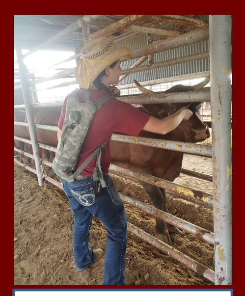
USDA-APHIS-VS Laredo, TX